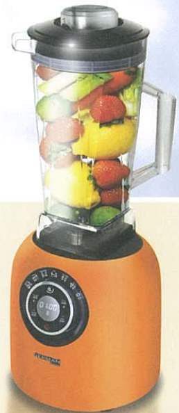
German Pool PRO-10 Professional High-Speed Food Processor