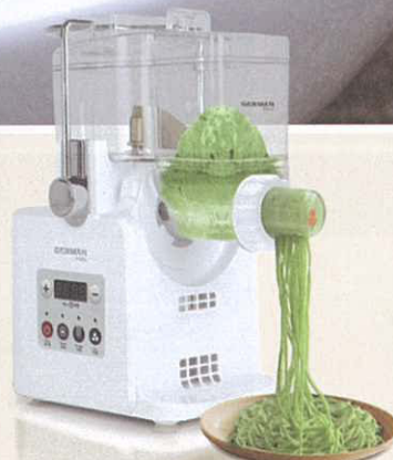
German Pool PAM-181 Automatic Dough and Noodle Maker

Overdone it at Christmas? Let German Pool's brand new Automatic Dough and Noodle Maker help you with that January purge. The Noodle Maker combines a 360° head-kneading technique, a patented downward extrusion mechanism and an automatic fan-dry technology to churn out untangled noodles in minutes. Why not deploy German Pool's Professional High-Speed Food Processor and its 30,000 RPM of power to unleash all the super food goodness of spinach, to spin a high fiber alternative of the Japanese staple? Use the Food Processor to create fish paste, tomato, and abalone puree for a variation of the ramen too. The German Pool Automatic Dough and Noodle Maker and the Professional High-Speed Food Processor are Your Ultimate Choice.