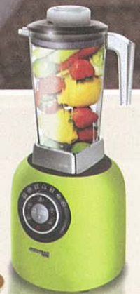
German Pool PRO-10S Professional High-Speed Food Processor