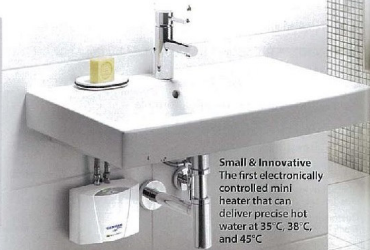
Small & Innovative The first electronically controlled mini heater that can deliver precise hot water at 35°C, 38°C, and 45°C