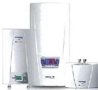
Smart Control system Extra convenience and smarter resources control. One iPad can control up to 10 compatible instantaneous water heaters