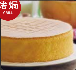
焗蛋糕烤肉 Cakes & Roasts