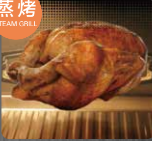
燒雞烤海鮮 Chicken & Seafood