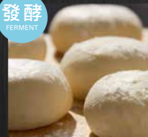
麵包及乳酪 Bread & Yogurt

高溫蒸氣 鎖住營養 High Temperature Steam Locks in Nutrients 以115°C 高溫蒸氣烹調，避免食物水份流失，完美鎖住味道和營養，確保食物鮮嫩多汁，原汁原味，是健康素食首選。 115°C high temperature steam cooking prevents moisture loss in food and enables food to retain its healthy nutrients and genuine flavors.