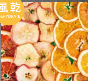
生果及肉乾 Fruits & Jerkies

立體熱旋風 烘焙一流 Hot Air Convection For Fluffy Cakes & Golden Roasts 以1,800W火力配合熱風對流系統加速熱循環，將熱量均勻送至爐內每個角落，食物受熱更均勻，烤雞完美金黃酥脆，烘焙蛋糕更勻稱飽滿。 1,800W with 3D heat circulation system delivers high heat evenly throughout the oven cavity, cakes bake fluffy and roasts burst with flavours.