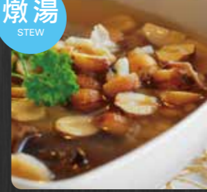
燉老火靚湯 Soups & Stews