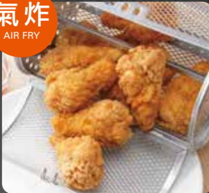
炸雞炸薯條 Wings & Fries