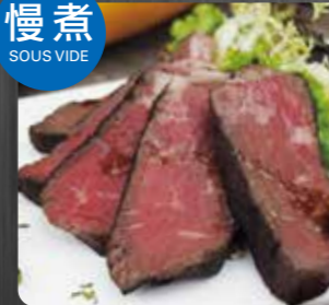
牛柳及蔬菜 Beef & Vegetables