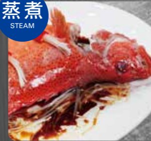
蒸魚蒸海鮮 Fish & Seafood