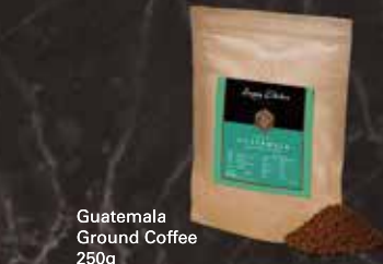
Guatemala Ground Coffee 250g