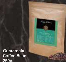
Guatemala Coffee Bean 250g

The exquisite natural aroma of coffee beans and ground coffee, taste the full bodied coffee with caramel and chocolate aftertaste. Enjoy the fruity notes of peach jam with a hint of citrus sweetness. Medium grind is recommended for coffee beans for best extraction, ground coffee is already at its optimized coarseness.