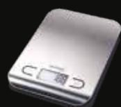
ESK-400 食物電子磅 Electronic Food Scale 精確量度咖啡豆重量 Precisely weigh coffee beans