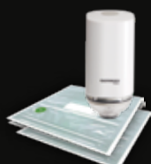
VAS-300 USB充電真空保鮮機 USB Handheld Vacuum Sealer 保留咖啡豆天然味道 Preserve the natural aroma of coffee beans

產品規格及設計如有變更，恕不另行通知。最新版本以www.germanpool.com網上版為準。 Specifications are subject to change without prior notice. Refer to www.germanpool.com for the most up-to-date version. 中英文版本如有出入，一概以英文版為準。 If there is any inconsistency or ambiguity between the English version and the Chinese version, the English version shall prevail.