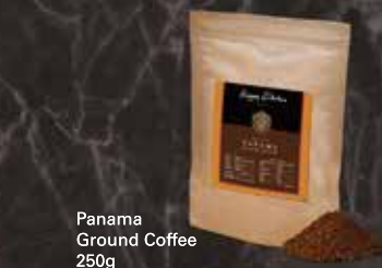
Panama Ground Coffee 250g