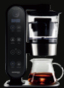
CMV-200 真空冷萃咖啡機 Vacuum Cold Brew Coffee Maker 2分鐘極速冷萃咖啡 2 minute cold brew coffee