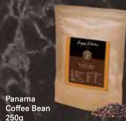
Panama Coffee Bean 250g

Immerse yourself in the natural aroma of coffee beans and ground coffee. Taste the full bodied coffee with caramel and hazelnut aftertaste. Enjoy the rich buttery texture with a hint of plum sweetness. Medium grind is recommended for coffee beans for best extraction, ground coffee is already at its optimized coarseness.