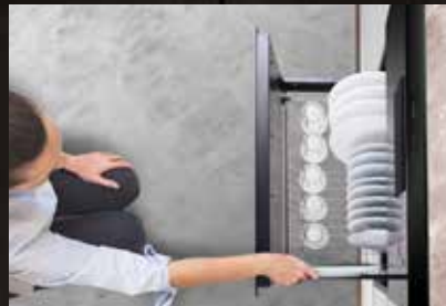
光波烘乾技術 杜絕細菌滋生 Halogen Heat-drying Technology Prevents Growth of Bacteria