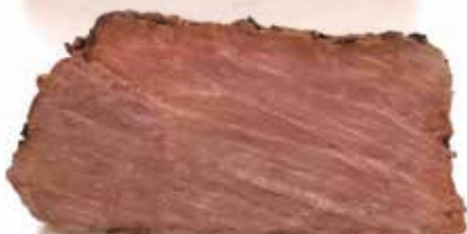
Well Done 全熟