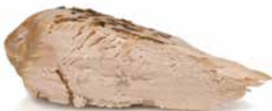
Chicken: Either undercooked or overcooked, dehydrated and tough 雞肉：雞肉太生或過熟，肉質乾硬