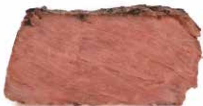
Medium Well 7 成熟

傳統烹飪方法很難掌握食物生熟度，要煎出完美的半熟牛扒更是難上加難。SOUS VIDE PRO 細分烹調溫度，將溫度調節精確至 0.5°C，配合精確時間控制和恆溫烹調，輕輕鬆鬆就可精準掌控生熟程度，想要幾熟就幾熟，隨心所欲！