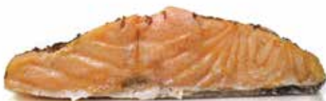
Salmon: Dull-coloured, charred, shrunk in size, dehydrated and tough 三文魚：顏色變暗淡、部分燒焦、縮水變形、肉質乾硬