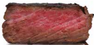
Steak: Unevenly cooked, tough and dehydrated 牛扒：生熟不均，縮水變乾