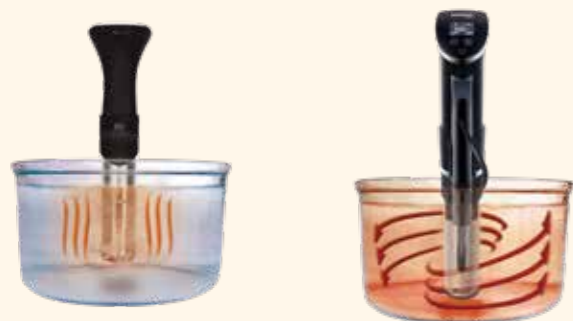
其他品牌慢煮機 Ordinary Slow-Cookers

一般水流微弱，要花較長時間才能達到設定水溫，熱量集中在機。Stagnant water takes longer time to reach the set temperature as heat is concentrated at and the