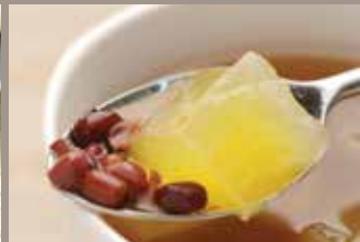
紅豆沙 Red Bean Soup