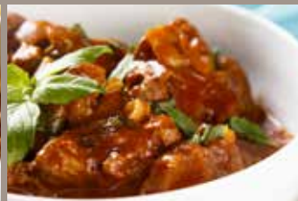
牛腩 Beef Stew